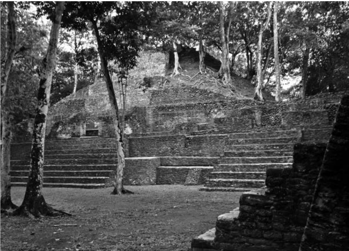
Belize, Photo from Flickr/Suzanne Schroeter